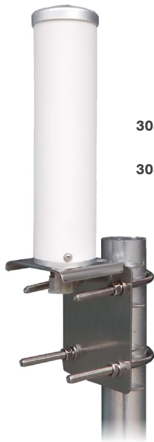
304422 4G Omni Plus Building Antenna (50 ohm)