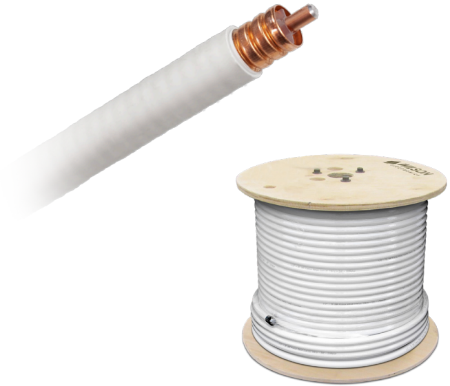
473154 500 ft. of Wilson 1/2 Plenum Cable shown