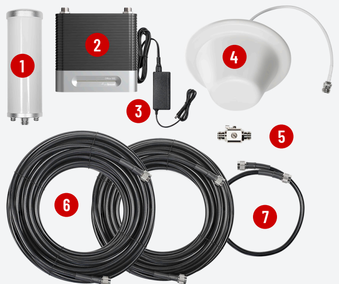
Items shown are for the Office 100 Omni 50 Ohm