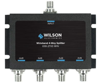
850036 4-Way Splitter