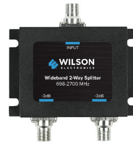
850034 2-Way Splitter