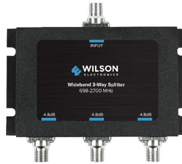
850035 3-Way Splitter

Warning: Cancer and Reproductive Harm - www.P65Warnings.ca.gov